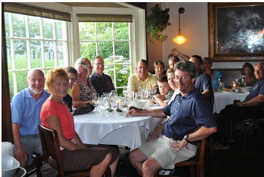
ANOTHER 2009 CRUISE DINNER

If you have not yet joined us on an OSCA Summer Cruise this year is a great time to start. We look forward to seeing you so reserve the dates of Saturday July 17th through Sunday July 25th!